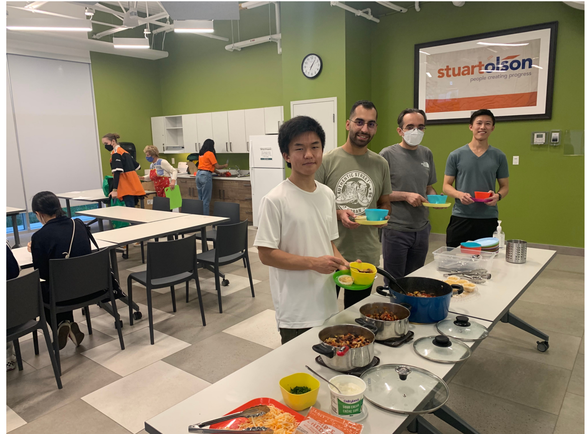
Weekly Thursday Campus Kitchen workshops