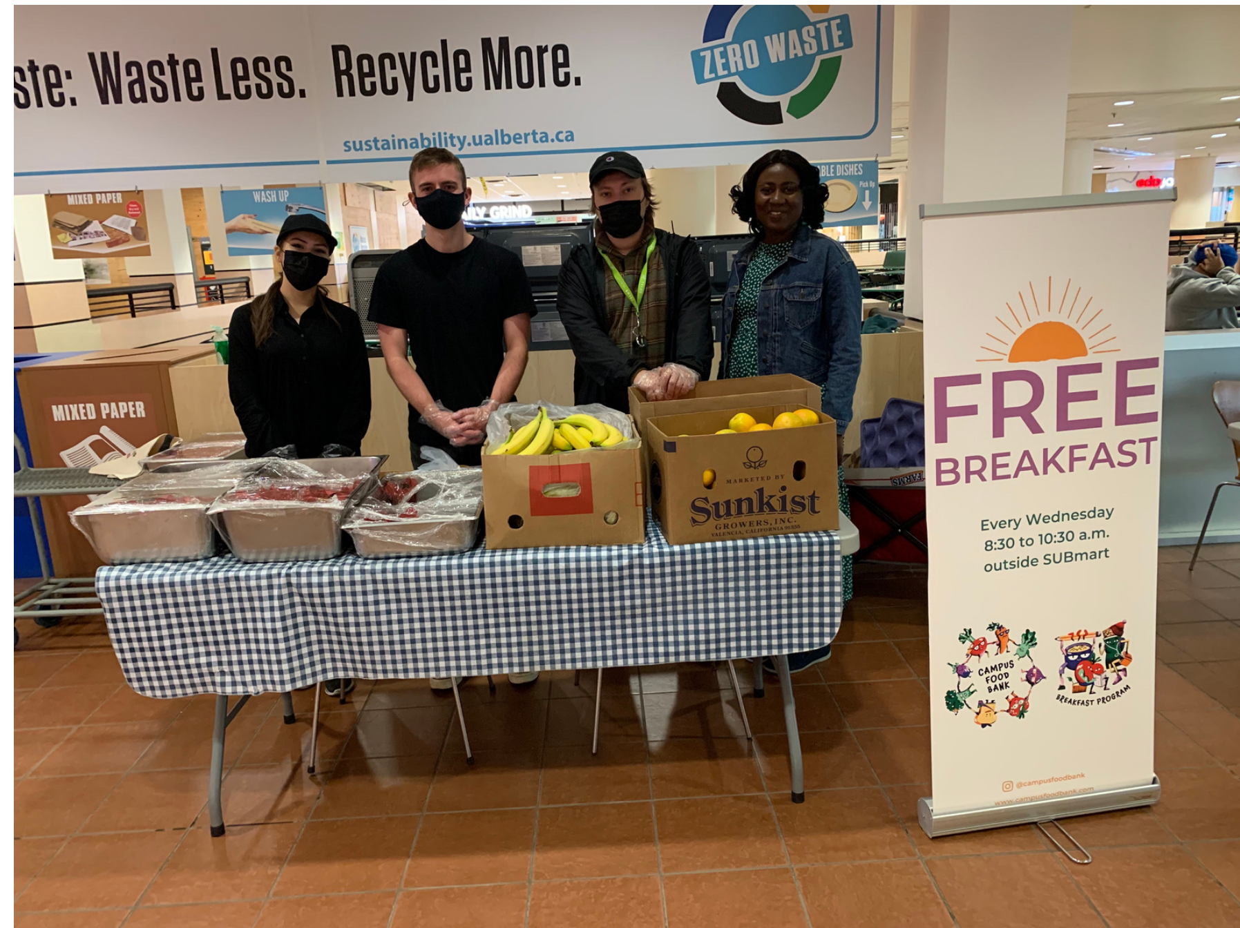
Weekly Wednesday breakfast in SUB